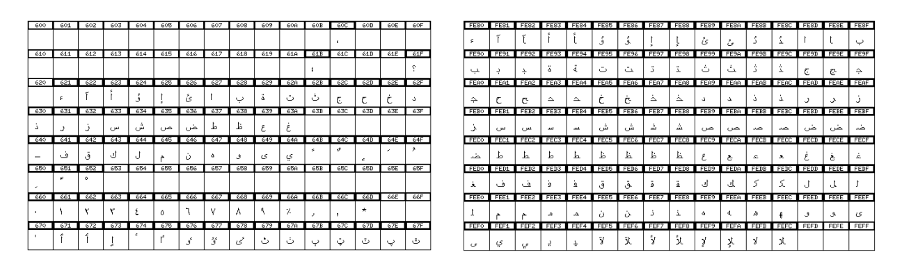
Figure 2: Arabic blocks of Unicode used for example.